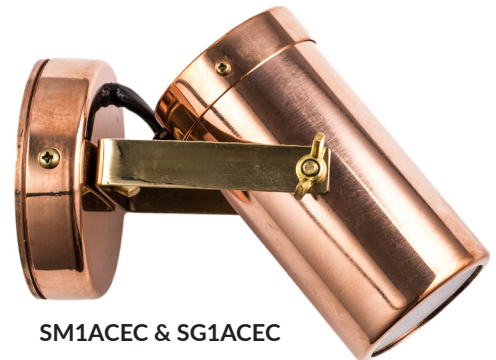
SM1ACEC & SG1ACEC