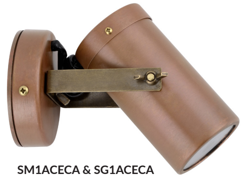
SM1ACECA & SG1ACECA